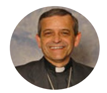
+ D by Songs

Chairman, Committee on Cultural Diversity in the Church